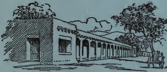
PALACE OF THE GOVERNORS

PUBLISHED QUARTERLY BY THE HISTORICAL SOCIETY OF NEW MEXICO AND THE UNIVERSITY OF NEW MEXICO